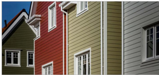
FIGURE 1: HARDIEPLANK® IN USE

This EPD applies to three painted fibre-cement panel products used for external cladding of buildings: HardiePanel®, HardiePlank® and HardieLinea® (pictures below). The products are supplied as panels (boards) of standard dimensions. These products have been engineered for maximum longevity in the European climate, and withstand a diverse range of weather conditions such as wind, rain, hail, snow and sun. They are also resistant to mould, decay, pests and rot.